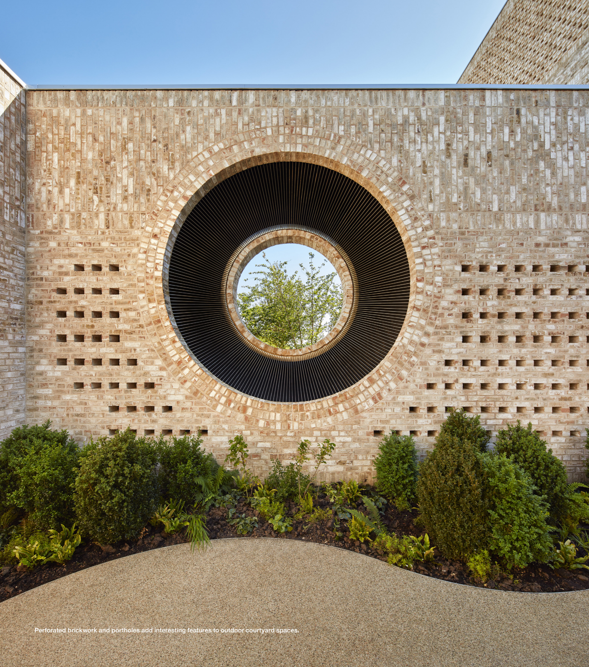
Perforated brickwork and portholes add interesting features to outdoor courtyard spaces.