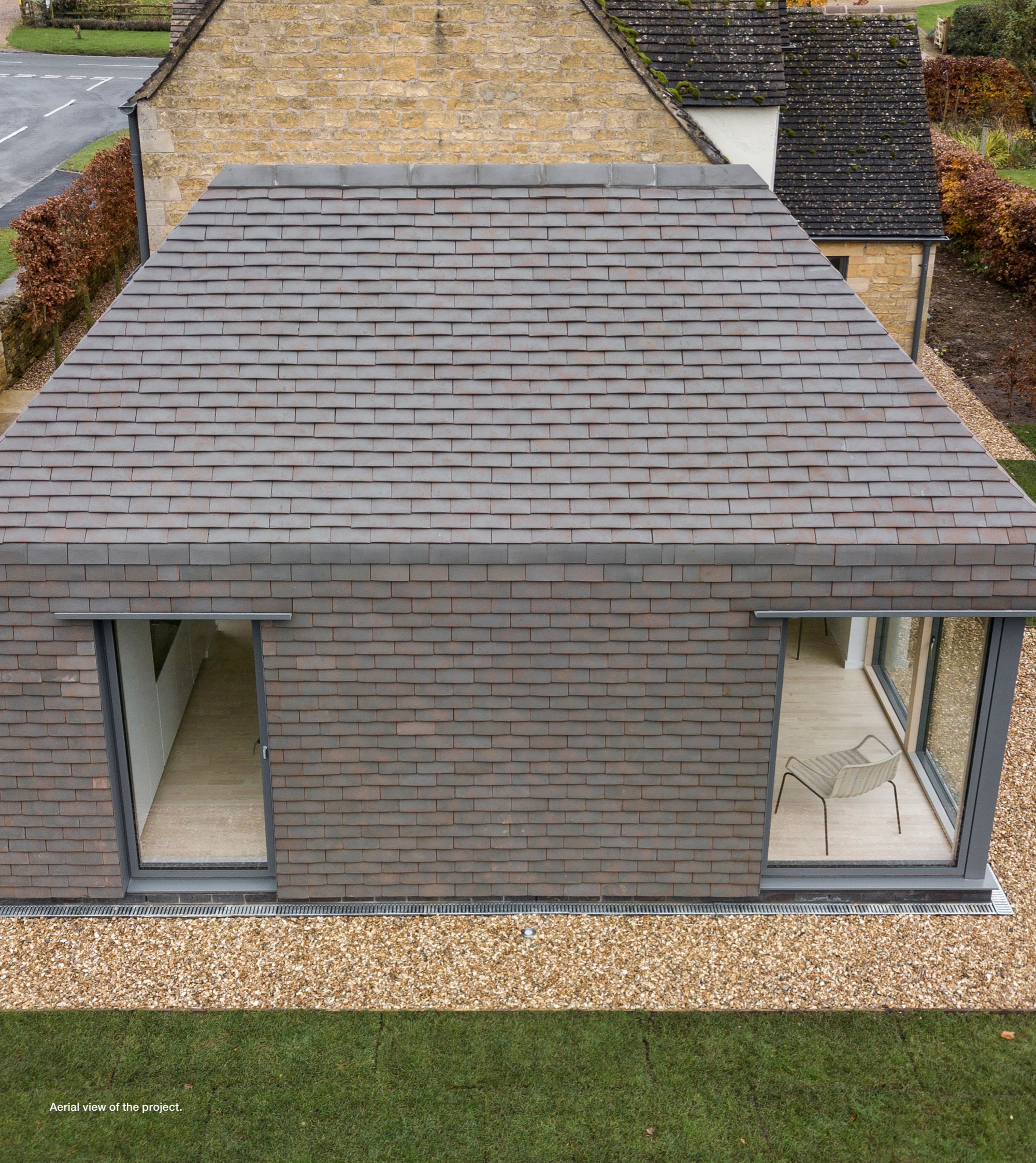
Aerial view of the project.