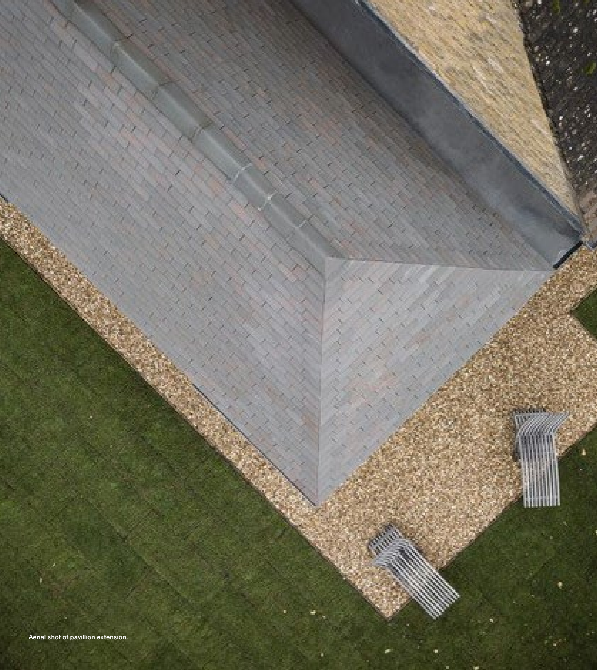
Aerial shot of pavillion extension.