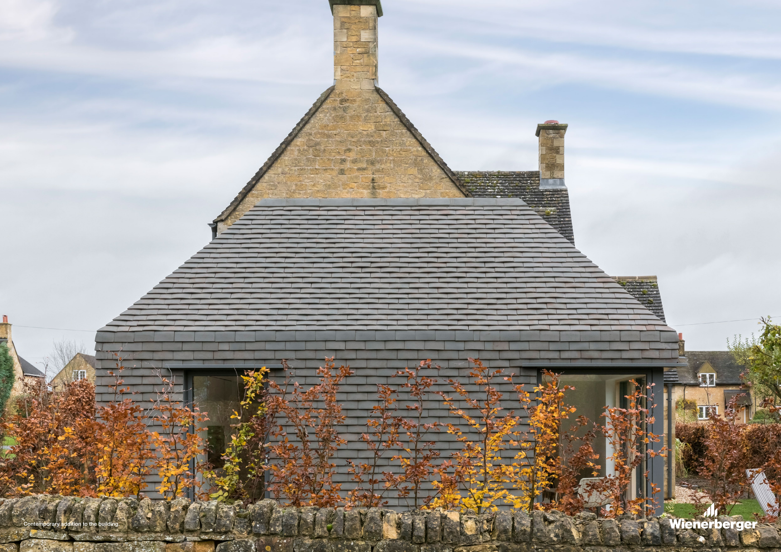
Contemporary addition to the building.