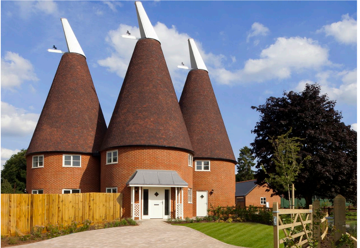
The striking Oast House at Oast Court Farm